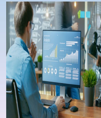
Data Science and Technology Research Training